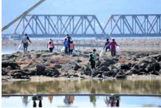
Volunteers collecting trash (Joanne Ong)