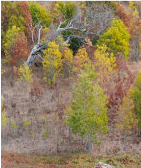
Don Edwards SFB NWR Fall Foliage