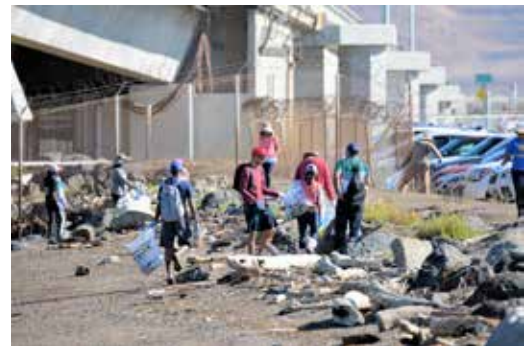
Volunteers finding microtrash (Say Zhee Lim)