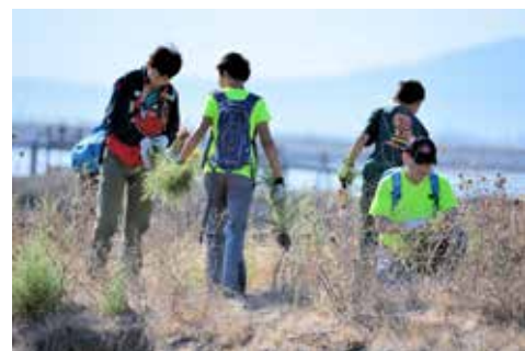
Removing invasive weeds during Coastal Cleanup (Joanne Ong)

Thus, volunteers continued to make a difference at our Refuges, and we look forward to a bigger presence from them when we open more completely soon!