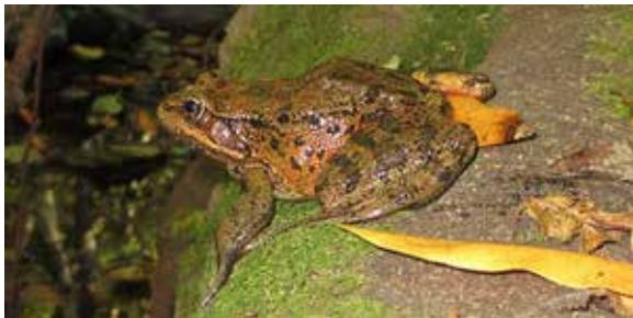
California red-legged frog (Midpen)