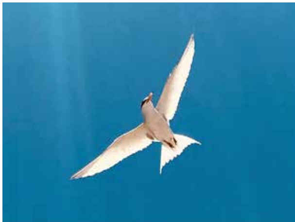
Adult Least Tern ( S. Euing )

At our San Francisco Bay Refuges, our endangered and threatened species were continuing on with their daily lives as usual, too. Salt marsh harvest mice continued to nibble pickle weed. Santa Cruz long-toed salamanders continued to migrate on rainy evenings. Ridgway's rails continued to move among the reeds undetected. Stellar sea lions continued to haul out on the Farallon Islands' rocky shores. Antioch Dunes evening primroses continued to flourish across the new sand dunes, and the California least terns returned as usual to their favorite nesting site in northern California, at VA Alameda Point.