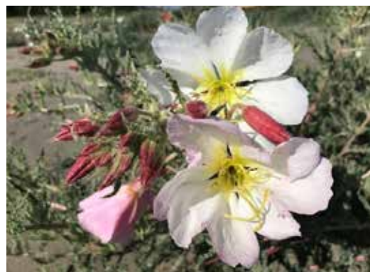
Endangered Antioch Dunes evening primrose, Oenothera deltooides howellii (Louis Terrazas)

Increasing the genetic analyses would require a budget increase. The project was already an example of federal and state agency collaboration. The extra funds needed were facilitated by the non-profit organization, the Friends of San Pablo Bay National Wildlife Refuge. The Friends Group supports the San Pablo Bay, Marin Islands and Antioch Dunes National Wildlife Refuges. This is because all three Refuges are operated out of the San Pablo Bay NWR headquarters in Sonoma County.