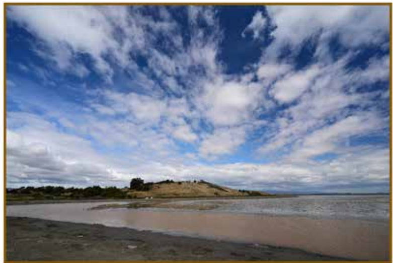
Don Edwards SFB NWR