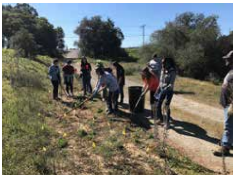
Students from Antioch Charter Academy II School clear out weeds from a previous planting, identify, count and flag endangered plants in February of 2020

Prior to the shelter in place orders we were able to host students from Antioch Charter Academy II, Sutter Elementary School, Contra Costa Christian School, and Antioch High School EarthTeam volunteers. Students visited the Refuge and learned about endangered species and wildlife conservation, explored the refuge and the San Joaquin River, and helped to clear weeds away from endangered plants and host plants for the endangered Lange's metalmark butterfly