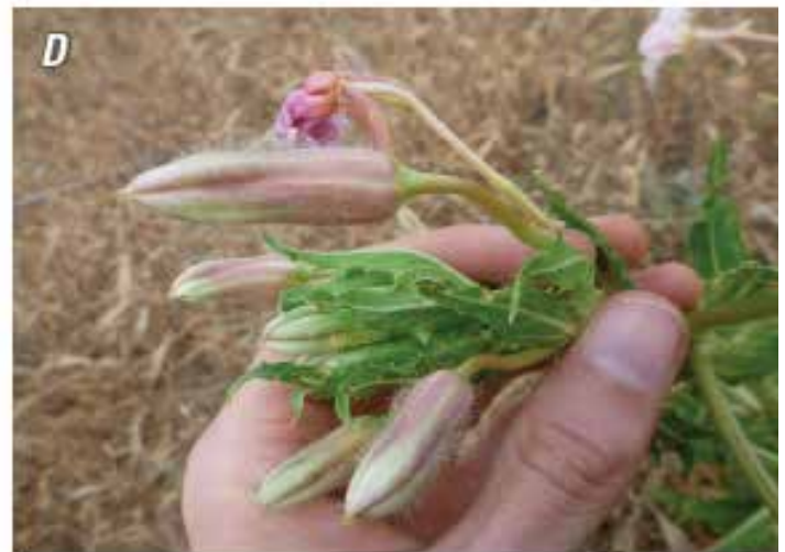
Clade X

Want to support efforts like these in the North Bay Refuges?