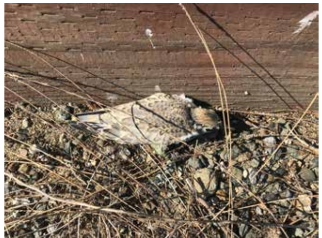
Soon to be flying least tern pre-fledgling

It "terned" out that the endangered California least terns had a pretty good year at VA Alameda Point in 2020, reproductively speaking. The numbers of eggs, nests, fledglings, and breeding pairs all increased from 2019. In these days of COVID-19, I feel most fortunate to have been witness to nature conducting business as usual and doing so well