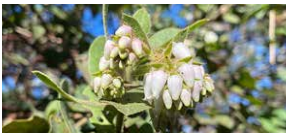
Kings Mountain manzanita (Midpen)