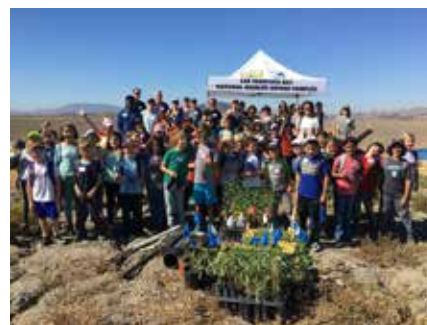
Elementary students pose for a photo before “digging in” and planting native plants as part of the Refuge/STRAW native plant restoration program in 2020.

Since 2008, our annual partnership program with STRAW has provided the main source of Environmental Education on the San Pablo Bay NWR. In FY2020 students from Vallejo Charter, Lincoln elementary, Valley View Elementary, Loma Verde Elementary, Live Oak High School, Park School and Lawrence Jones Middle School planted 1,141 native plants which will directly benefit the Endangered Salt Marsh Harvest Mouse, California Ridgway's Rail and other marsh dwelling wildlife.