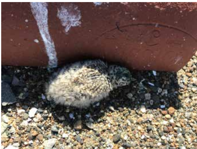
Week-old Least Tern chick

Since we began our surveys in the middle of the breeding season, we discovered so many nests and chicks on our first day that we could not finish surveying the entire 9.7-acre nesting site after 7 long hours. There already were 99 chicks of all ages and 3 predated eggs on the ground. In order to discern how many nests, they represented, we applied same average clutch size (1.9 eggs/nest) as those nests we marked from June 16 to season's end.