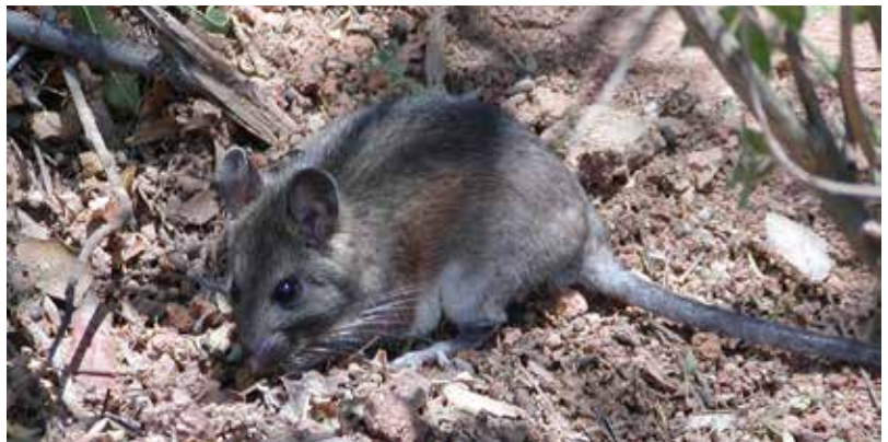
San Francisco dusky-footed woodrat