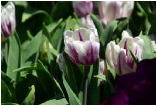
A study of contrasts: Tulips and Poppies from Filoli in the Spring (Ceal Craig)