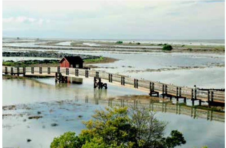
Two Views of king tide's at Don Edwards SFB NWR (Ambarish Goswami)