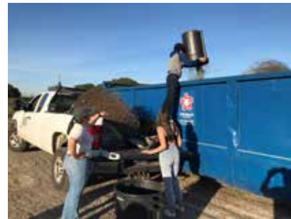
Students from Antioch High School work for the EarthTeam at Antioch Dunes NWR removing invasive plants and dumping them into dumpsters in February of 2020 (USFWS)

Volunteers Hugh Harvey and Michael Krieg helped staff collect native plant seeds. Volunteer intern Kaitlyn Romero assisted refuge staff with a buckwheat experiment at the Stamm Unit, where we cleared invasive plants, mixed seeds and sand, spread the seeds and raked them in for two specific plots.